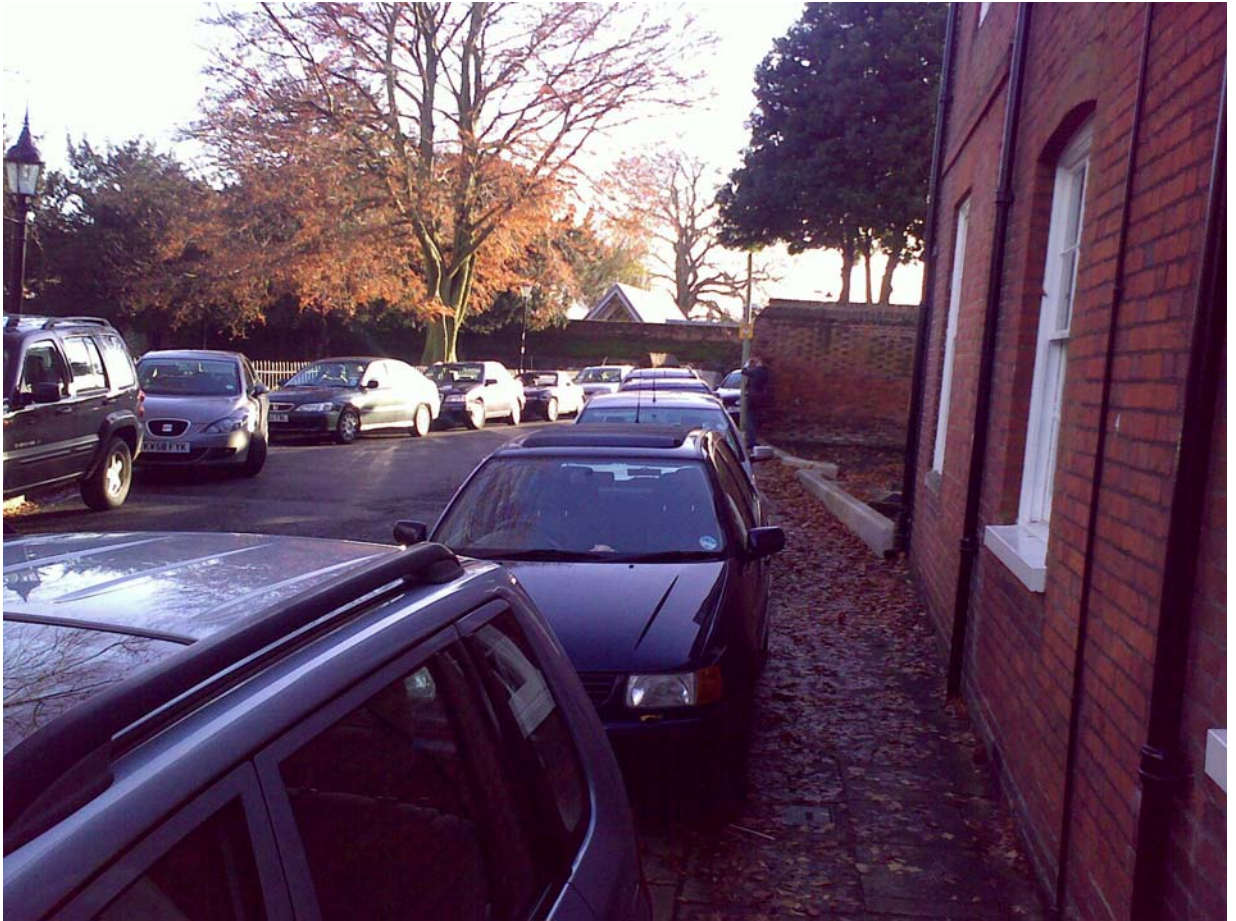
Great Minster Street looking South