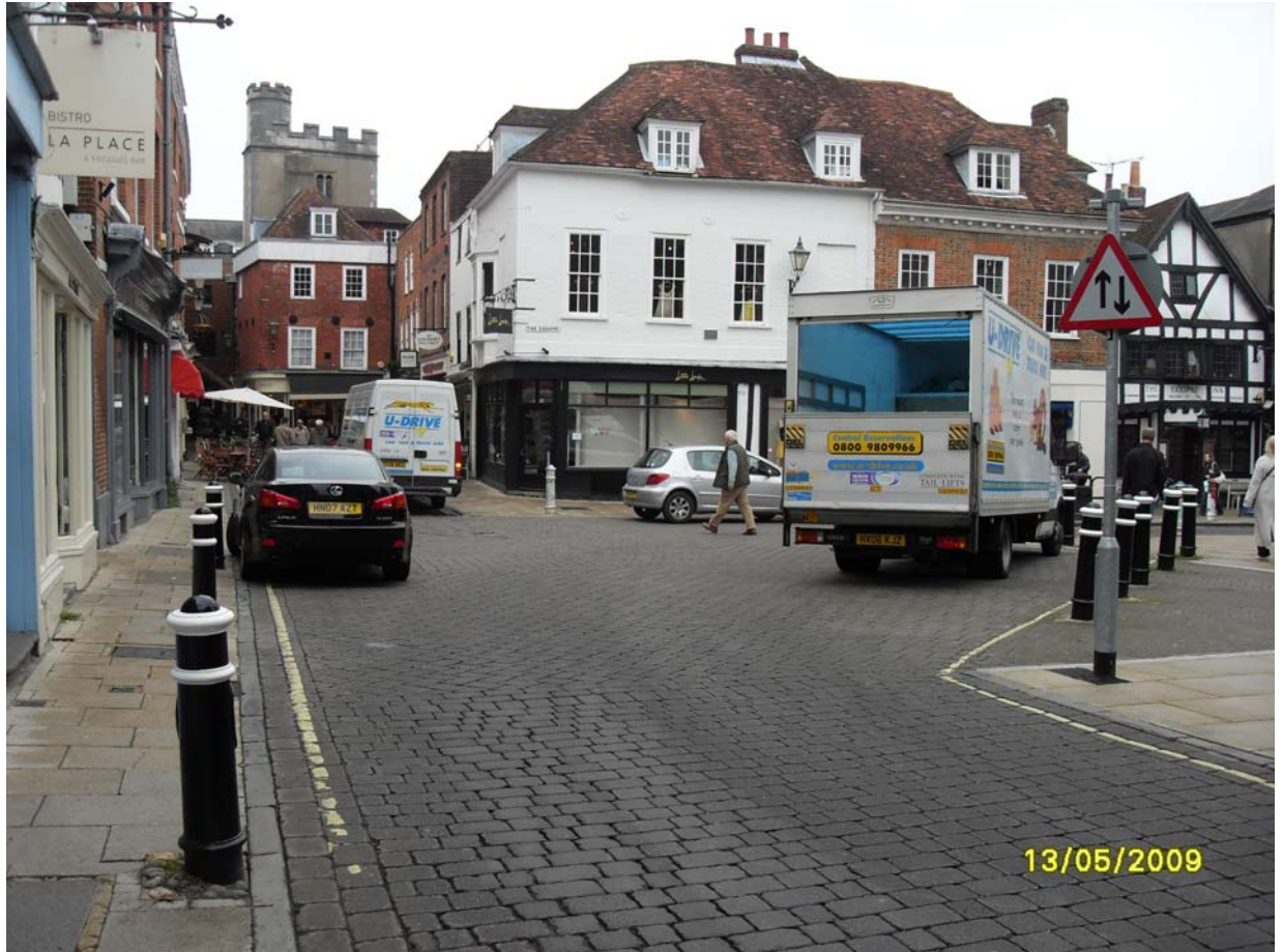
The Square looking North-East